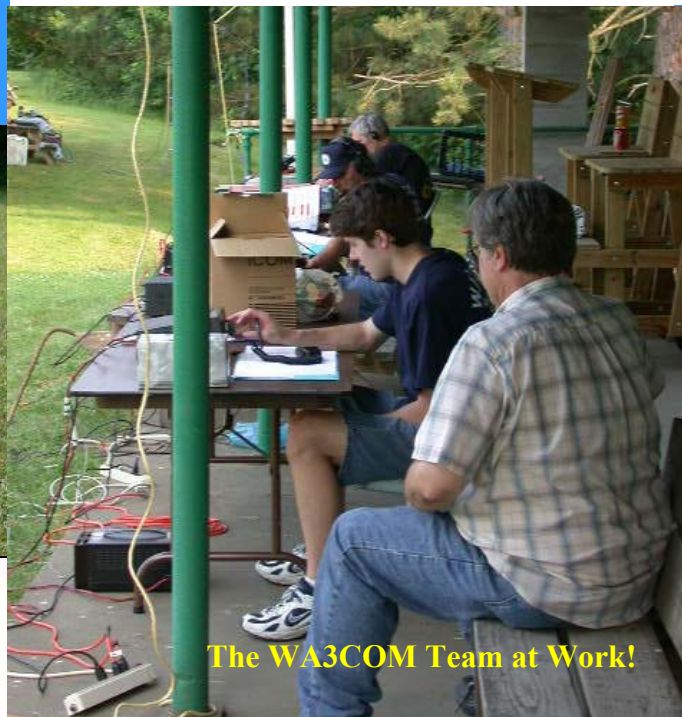
The WA3COM Team at Work!