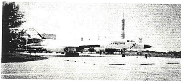
While in the neighborhood, a trip to the U.S. Air Force Museum at Wright-Patterson Air Force Base seemed in order.