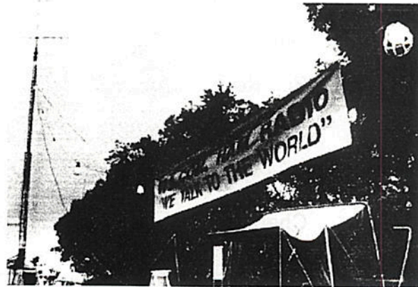
SCENES FROM WACOM FIELD DAY 1995