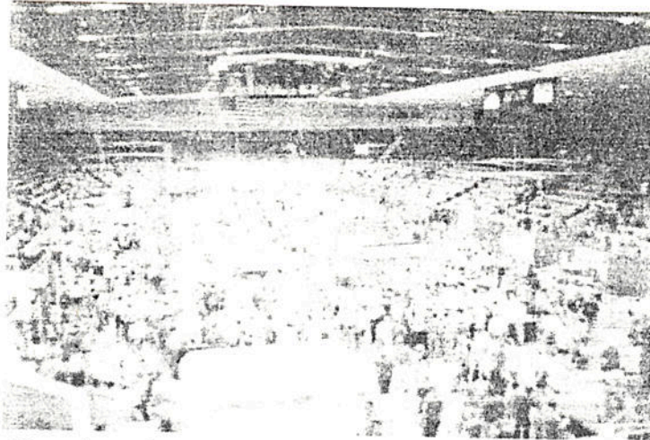
Hara Arena is the main section where only the big boys play. Hey Steve, do you think...nah!