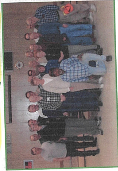
WACOM Members at the February Meeting

South Strabane #1 VFD 1696 East Maiden St. Washington, PA 15301