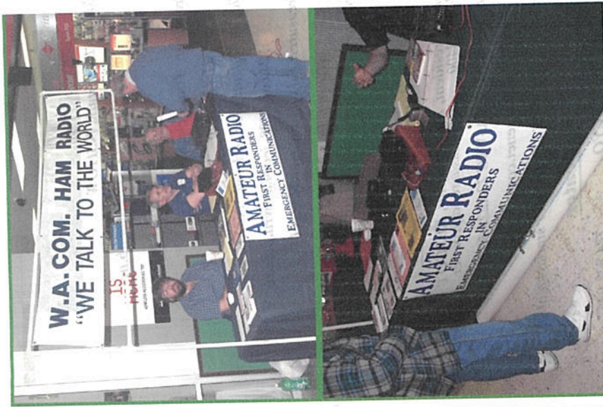
Our new vinyl sign for use at public shows